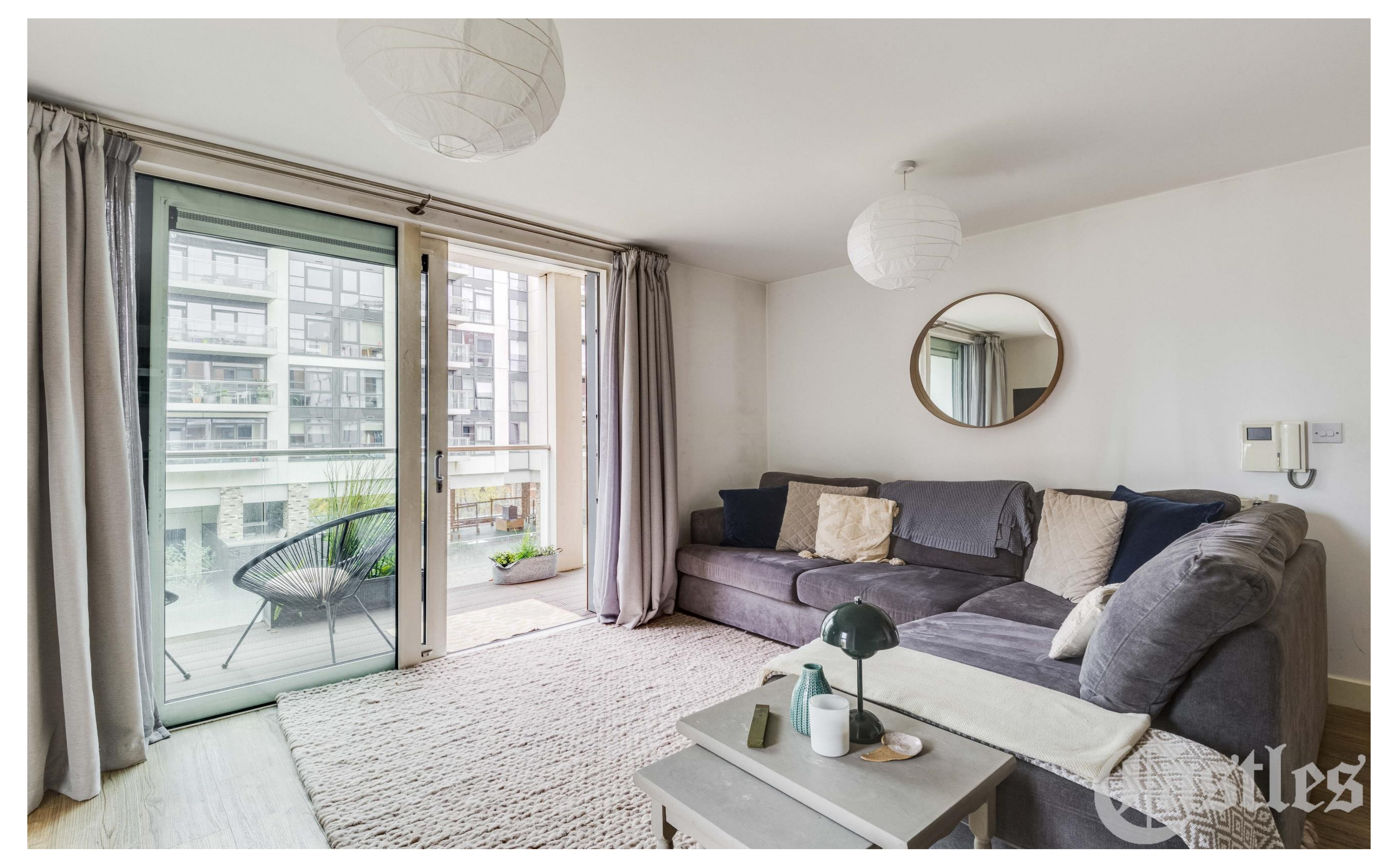
Marley House, Roseberry Place E8 3GD