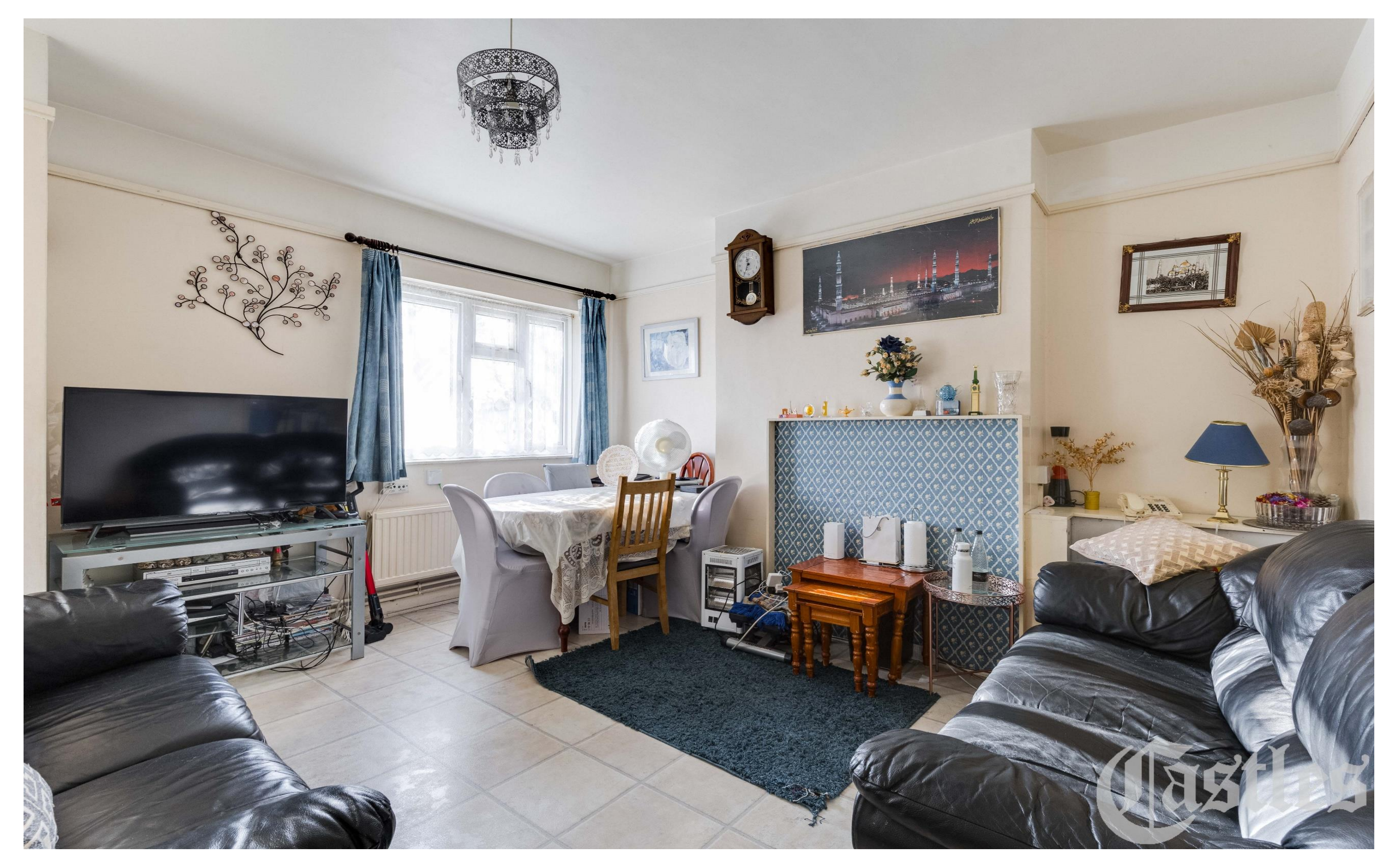
Woolridge Way, Loddiges Road E9 6PR