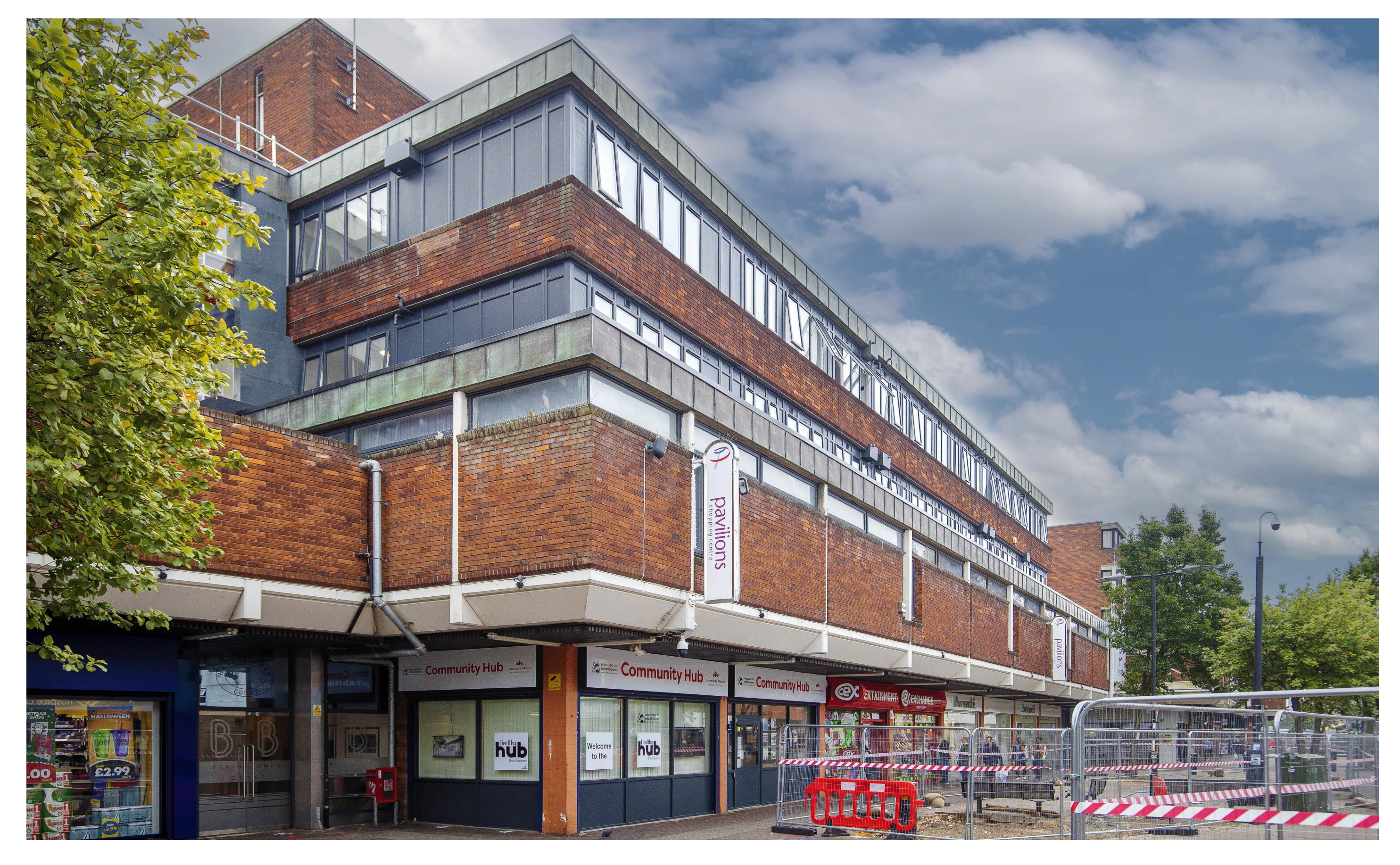
Bartholomew Court, High Street, Waltham Cross, EN8 7JU £195,000