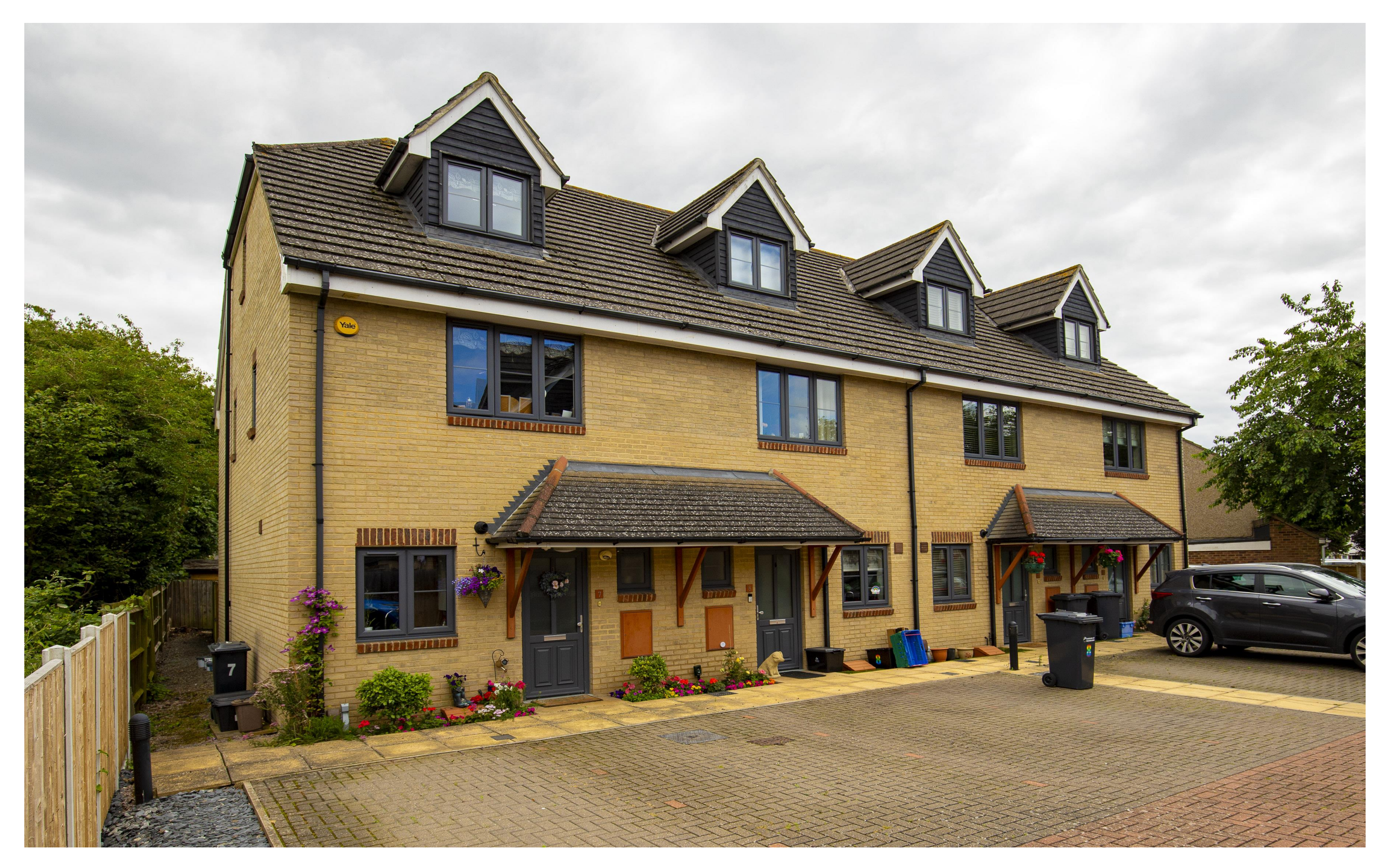
De Burgh Close, EN10