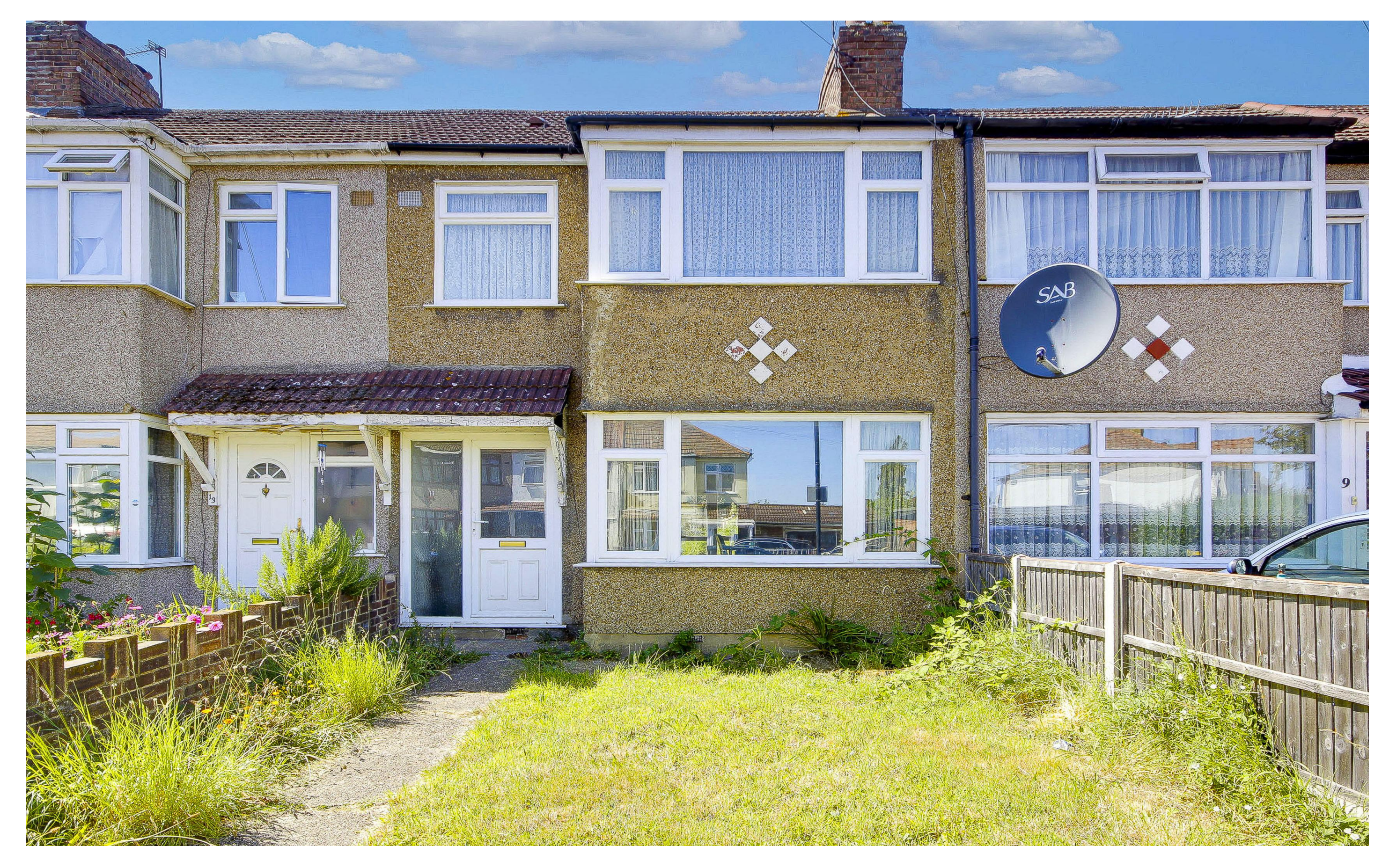
Dell Road, EN3 5RF