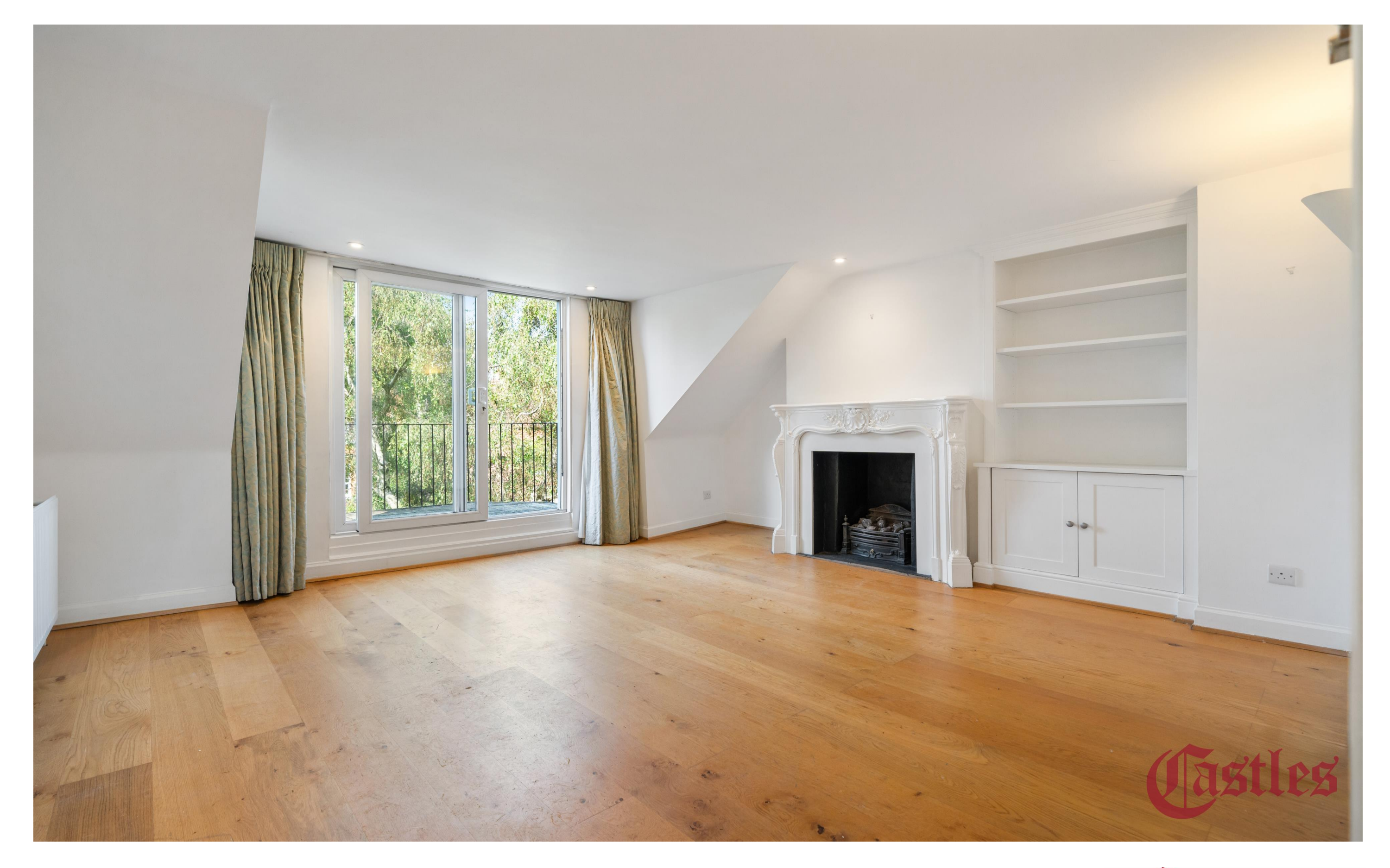
Coolhurst Road, N8