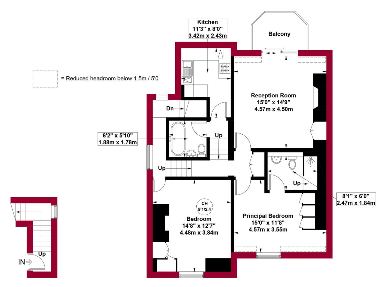
First Floor Gross Internal Floor Area 43 sq ft / 4.0 sq m