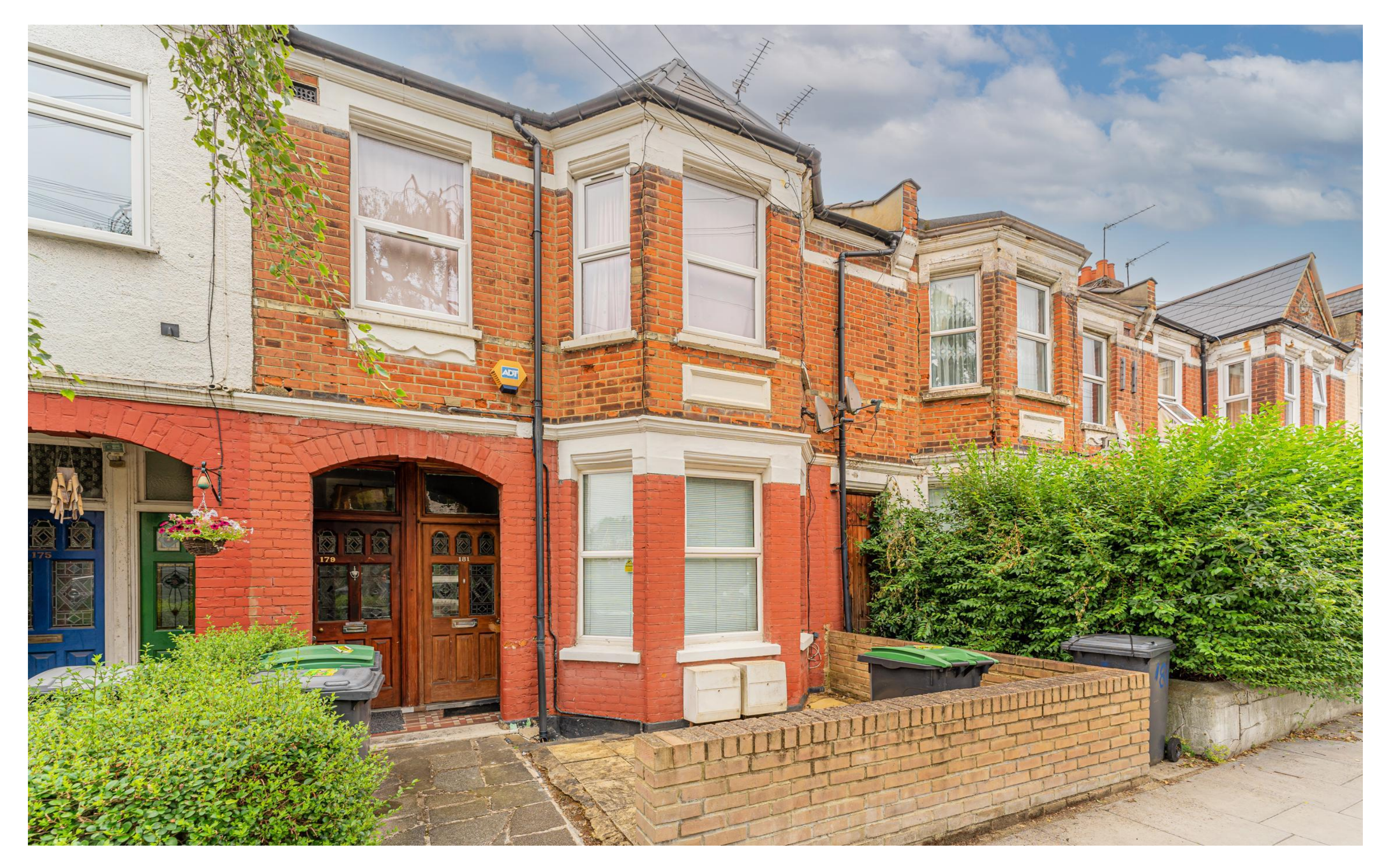
Lyndhurst Road, N22