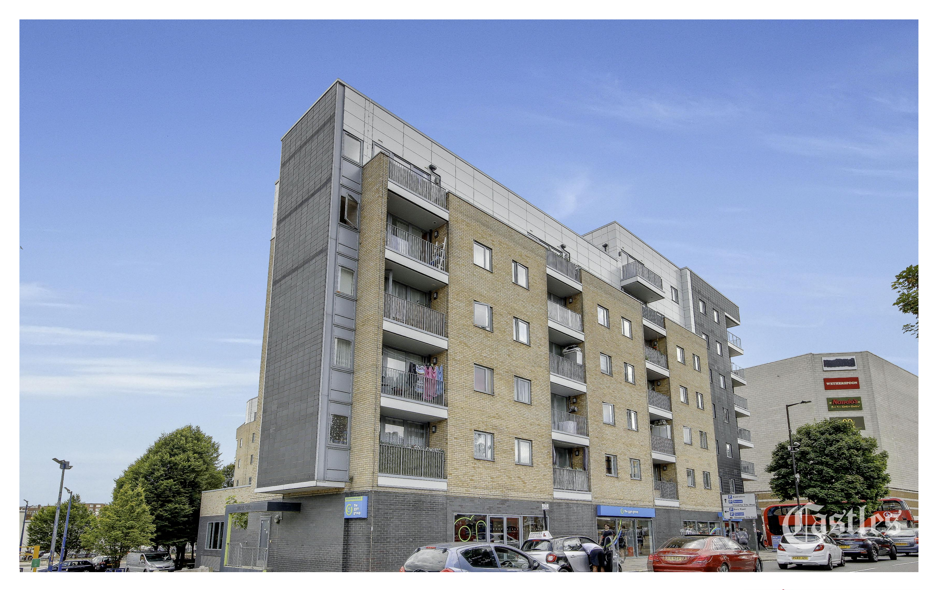
Redvers Road, N22