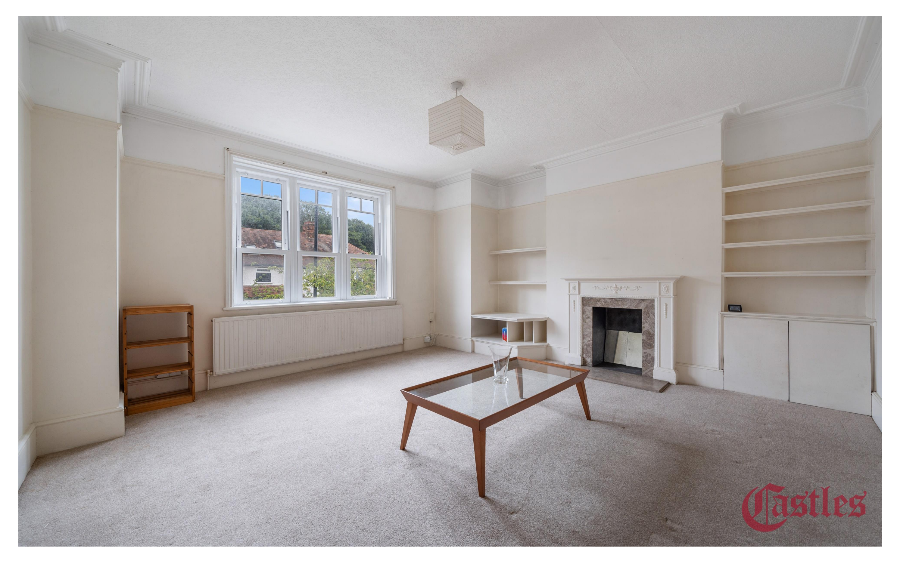
Cranley Gardens, N10