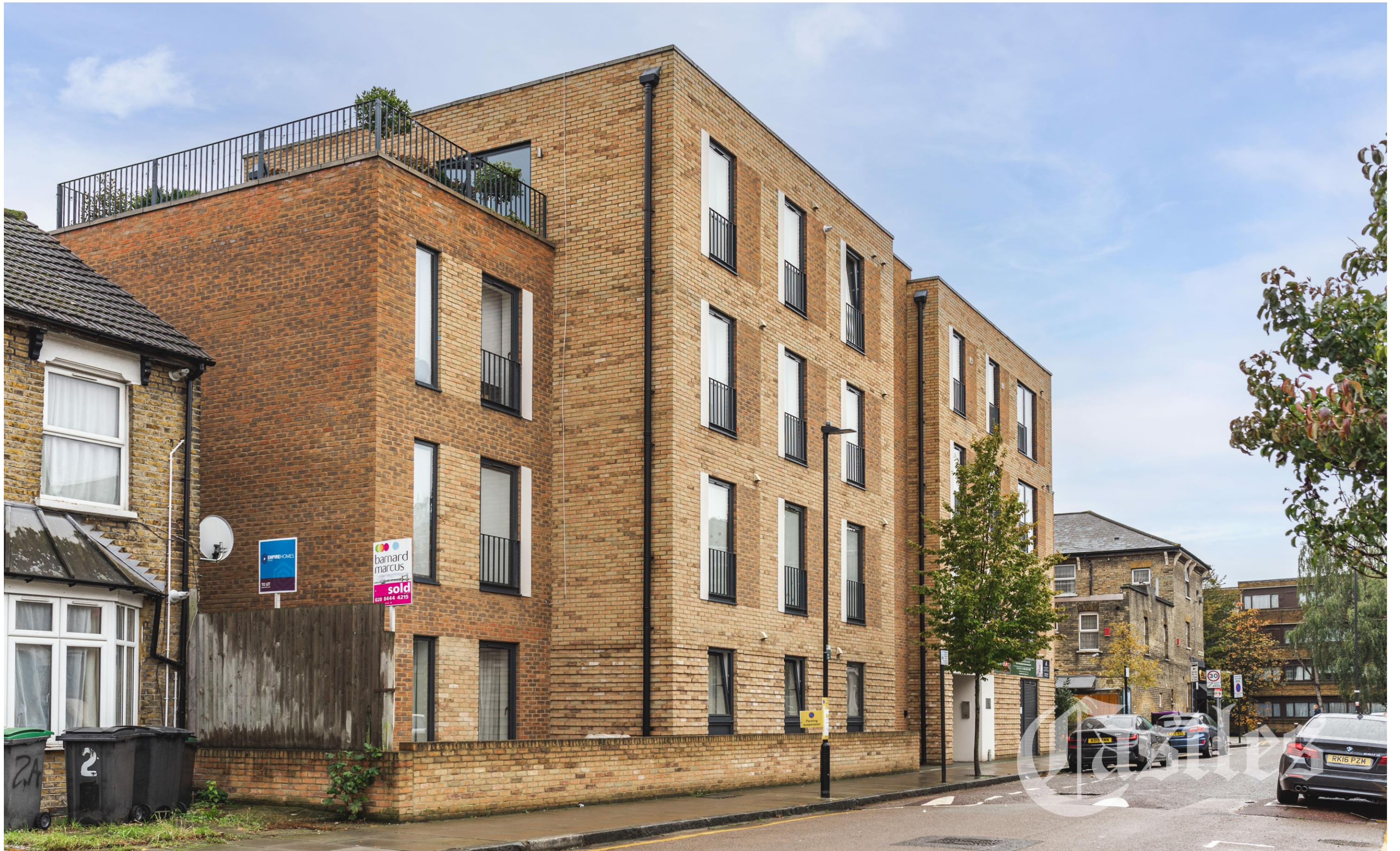
Woodside Apartments, Canning Crescent, N22 £350,000 Leasehold