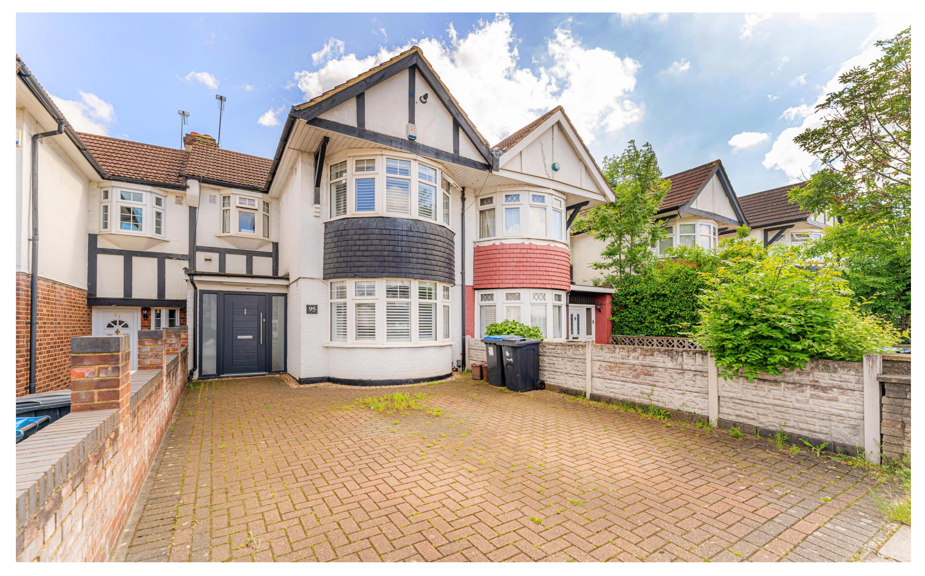
Pasteur Gardens, N18