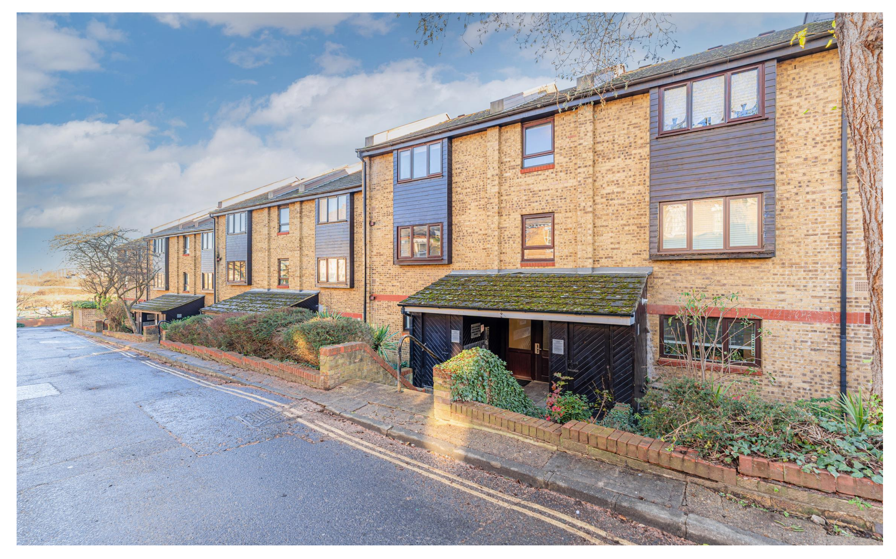
Bakers Hill, E5 9HL